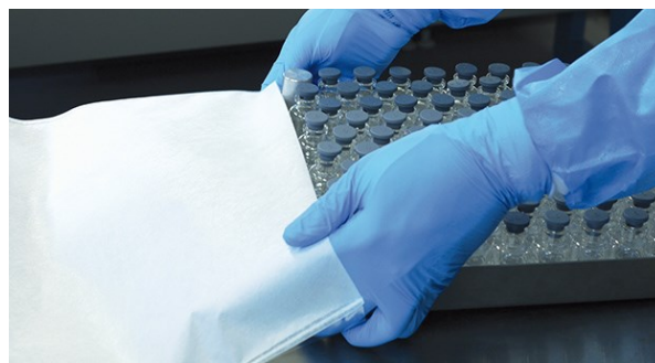
Tray with vials is placed into a Lyoprotect® Bag

The Teclen® Lyoprotect® Bag is designed for freeze-drying of pharmaceutical substances, such as enzymes, peptides and other API (Active Pharmaceutical Ingredient). The handling is very simple: Place your preferred drying container, e.g. a multiple-use stainless steel tray or a single-use tray, into the Lyoprotect® Bag, fill the container and close the bag with our Closing Stick. For subsequent freeze-drying, the regular parameters are used.