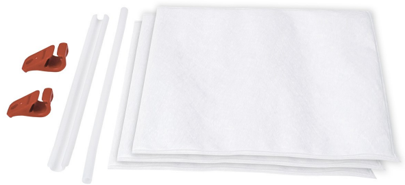
Lyoprotect® Bags with Closing Stick